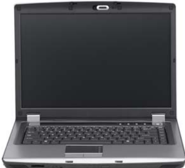
Model No. EL80 Intel® Core 2 Duo Processor

Shouldn't your computer reflect who you are? We'll build you a customized notebook based on new-generation Intel® Centrino™ mobile technology. You'll get cool graphics and surround sound audio, great battery life, and integrated wireless, all in a sleek, lightweight design + . Call today for your new notebook, backed by local support.